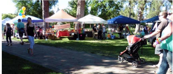
Above—Booths across the way from APUCC’s were typical of the color and variety of offerings.