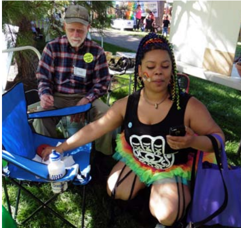
Above—A colorful volunteer drew prize winners’ names from a “hat.”